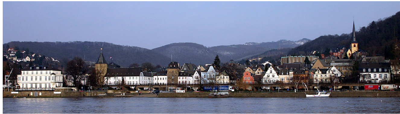
Scenes down the Rhine River: The Remagen Bridge and the colorful city of Linz am Rhein