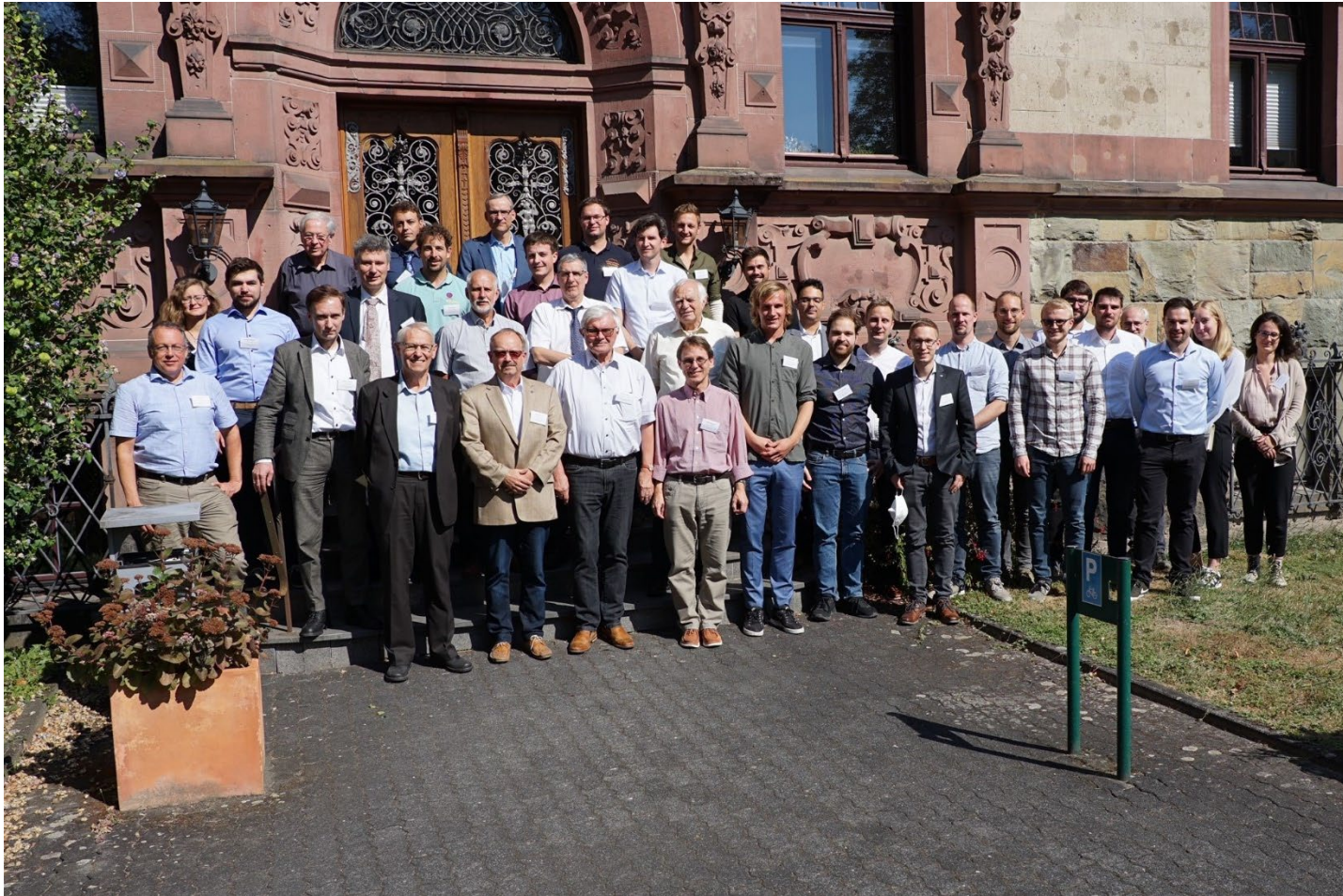
The participants of 8th ITG International Vacuum Electronics Workshop 2022