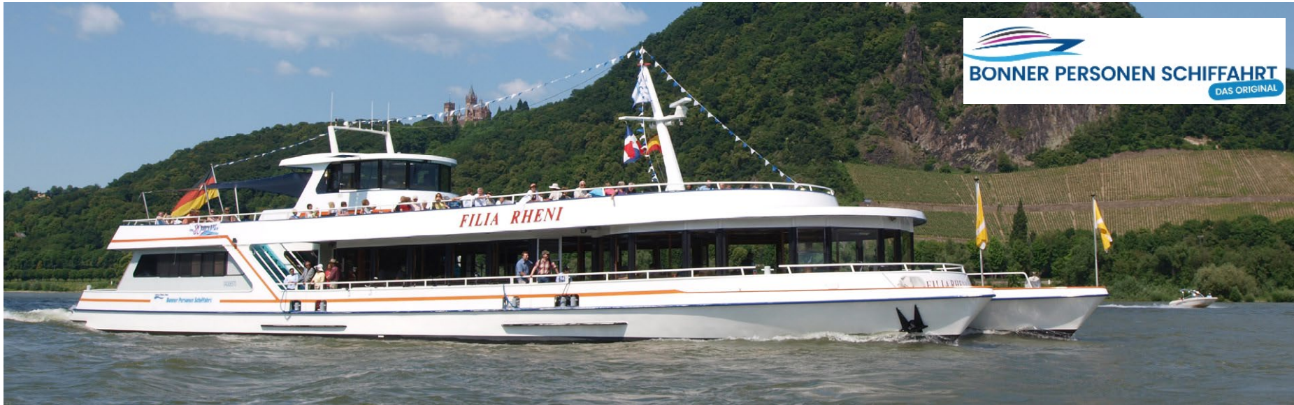
Evening cruise on the Rhine River on board the Catamaran FILIA RHENI with a fine Conference Dinner